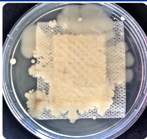
* Microbiological contamination of Commercially available Dressings

Study comparing the microbiological contamination of commercially available medical dressings versus TRIOMED™ dressings after only 1 hour on a patient.