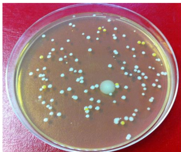
Commercially available Surgical Mask

Samples of each of the surgical masks were worn for 30 min, swabbed and plated. The plates were then incubated for 48hrs at 37°C.